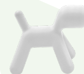
White 1735 C