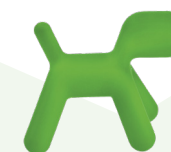
Green 1360 C