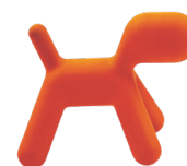
Orange 1001 C